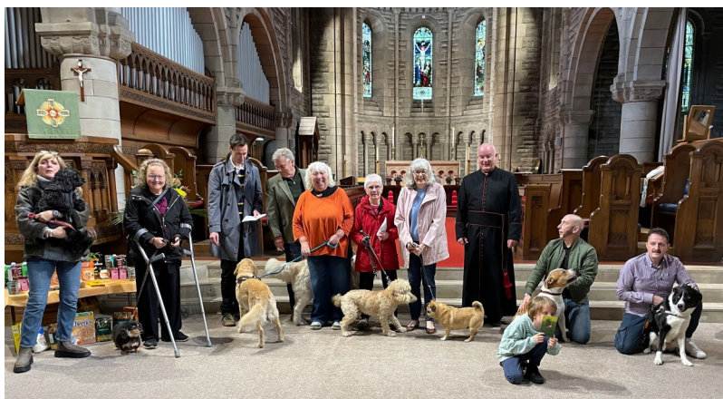
A Blessing of the Animals service was held at St Margaret's Newlands on 4 October 2025.